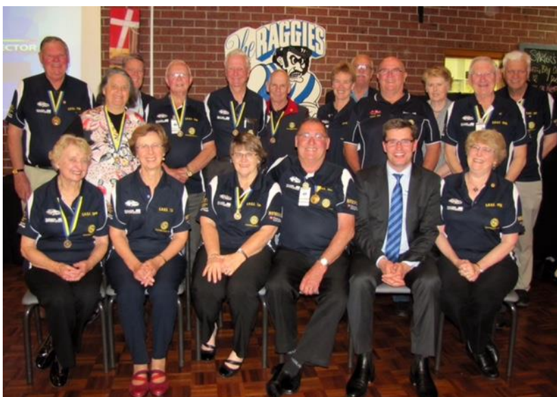
CROE Sponsors, Organisers and Supporters with RFDS Rep